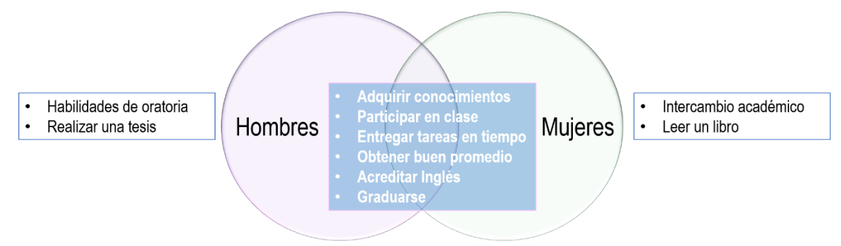
Figura 1. Metas académicas

The figures shown below present the results obtained from the content analysis of the data and according to the four categories and units of analysis (see figure 1).