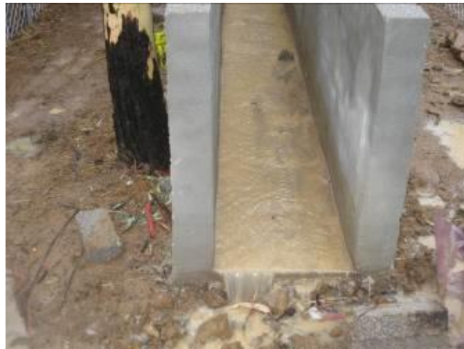
Figure 7. Hydraulic flow recorded in the Parshall channel of micro-basin 1, during the atypical rain event of February 2010.

In the 2011 rainy cycle, it was only possible to record 12 rain events and refine the methodology for taking water and sediment samples. Due to the lack of a laboratory, it was not possible to analyze the amount of sediment, but according to turbidity, three of the micro-basins generate runoff with a high concentration of sediment. The same number of precipitation data was also recorded, but the corresponding analysis was not performed.