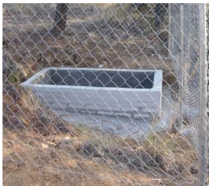
Figure 4. Cistern Trap where 25% of the runoff and sediments generated in each rain event will be collected.