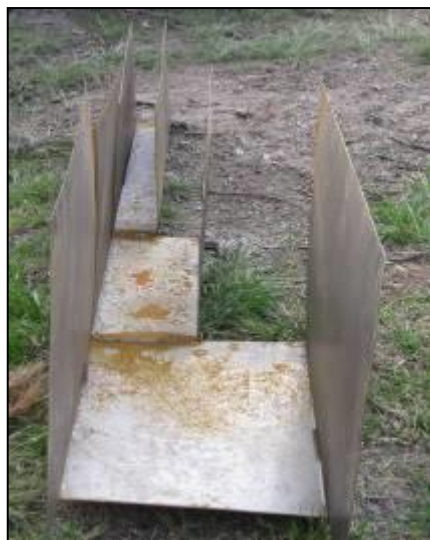
Figure 3. Water and sediment dosing channel seen longitudinally through the inlet nozzle.