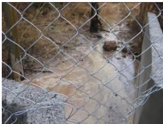
Figure 5. Concentration of runoff at the outlet of micro-basin I and entrance to the Parshall canal.

Figure 5 shows the concentration of surface runoff generated at the outlet of the micro-basin and at the entrance to the Parshall canal. Figure 6 shows the hydraulic operation of the channel before the flow of water, in which it is possible to measure the speed and depth of said flow and figure 7 shows the expense generated in this rain event. The previous observation indicates that the Parshall channel can be a good measurement instrument and motivates the execution of this project.