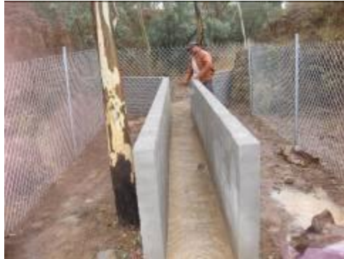
Figure 6. Hydraulic operation of the modified Parshall channel in micro-basin I.