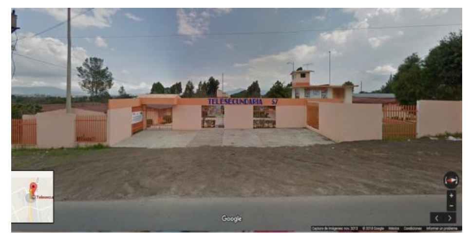
Figura 3. Escuela Telesecundaria 57, Almoloya Municipio de Acatlán, Hidalgo

Participation; the parents collaborate in the maintenance, economically, in civic and sociocultural activities. The students are between 12 and 15 years of age, some of them with emotional problems: cutting or marking a part of their body and family disintegration due to migration to the US. UU., Which reflects a transculturation in its behavior and the assumption of external behavior patterns (Alfaro, 1 de agosto de 2018, comunicación personal).