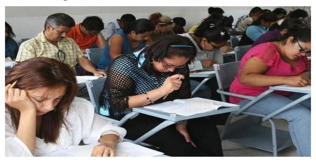
Figura 1. Docentes en el examen de conocimientos