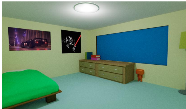
Figura 6. Escenario tranquilo