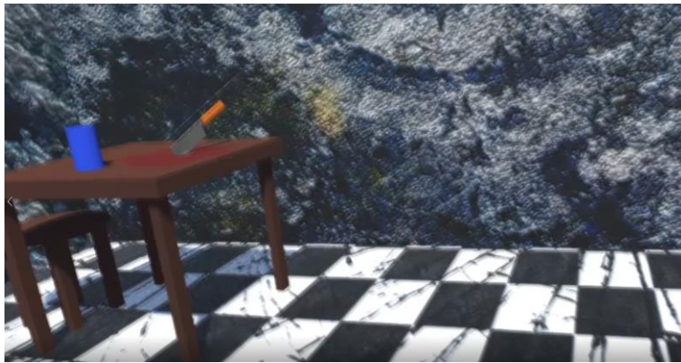
Figura 5. Escenario agresivo