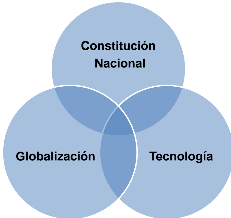
Graphic No. 1: Relationship between the National Constitution – Globalization – Technology.