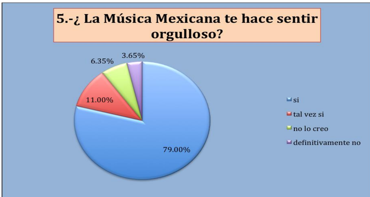
Gráfica 5. Correspondiente a la tercera pregunta del cuestionario aplicado para esta investigación