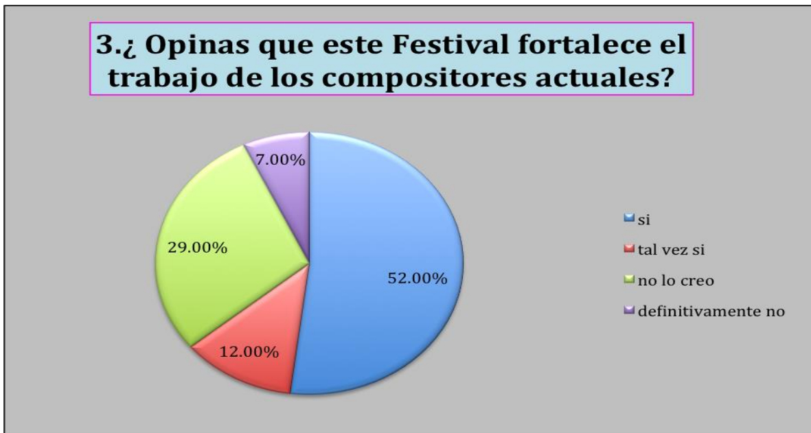
Gráfica 3. Correspondiente a la tercera pregunta del cuestionario aplicado para esta investigación