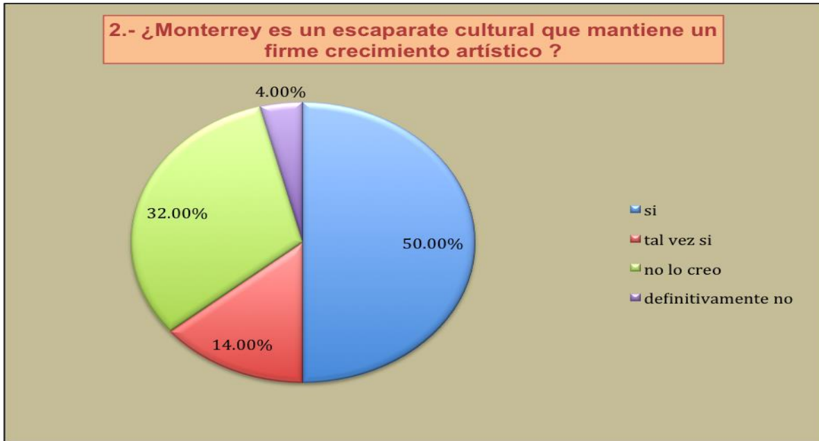
Gráfica 2. Correspondiente a la segunda pregunta del cuestionario aplicado para esta investigación