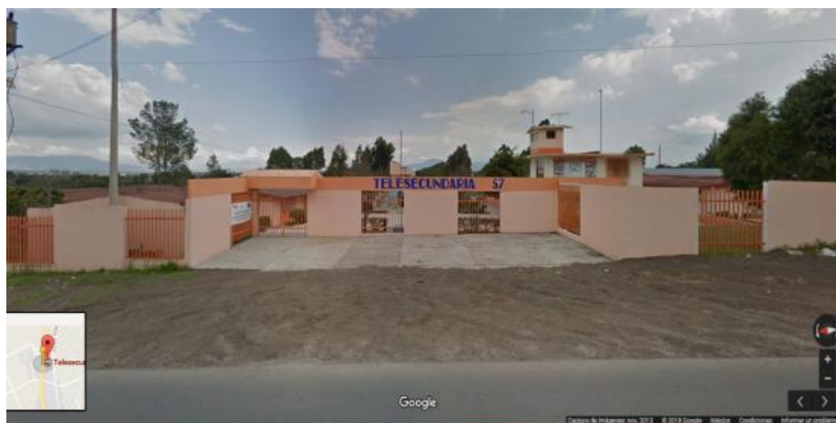
Figura 3. Escuela Telesecundaria 57, Almoloya Municipio de Acatlán, Hidalgo

Participation; the parents collaborate in the maintenance, economically, in civic and socio-cultural activities. The students are between 12 and 15 years of age, some of them with emotional problems: cutting or marking a part of their body and family disintegration due to migration to the US. UU., Which reflects a transculturation in its behavior and the assumption of external behavior patterns (Alfaro, 1 de agosto de 2018, comunicación personal).