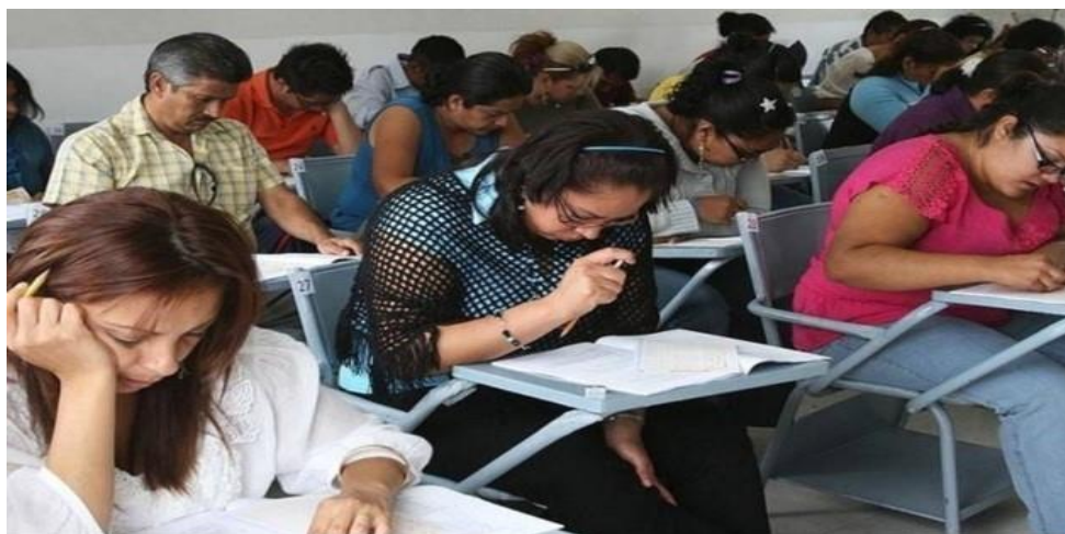
Figura 1. Docentes en el examen de conocimientos