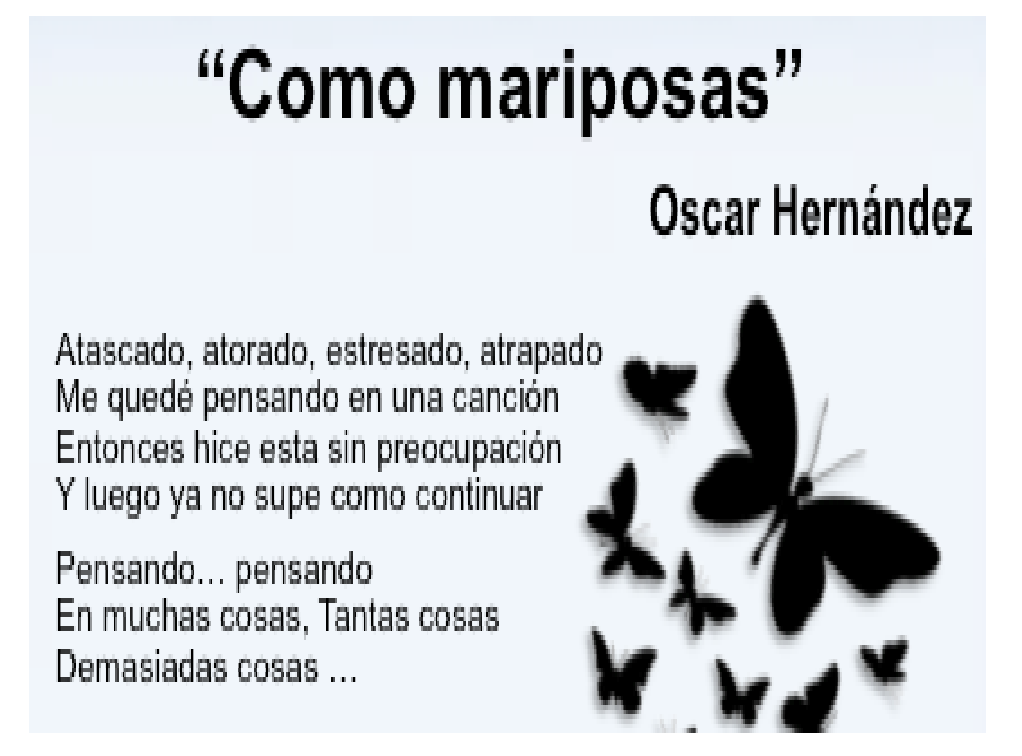
Figura 3. Estrofa de una canción elaborada por un estudiante del taller de arte y cultura